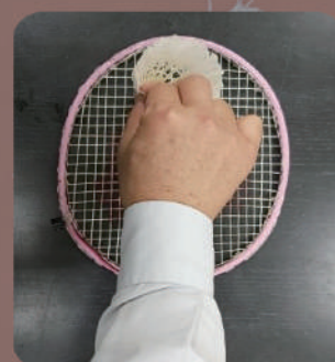
Not hitting the sweet spot