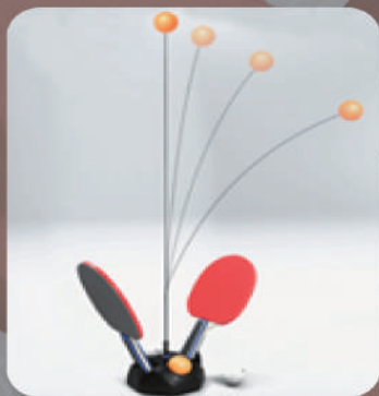
Table Tennis Exerciser

Our work is to use the principle of electrical conductivity to place the wire in the center of the racket and split the two wires, wrap the ball with aluminum foil to make it conductive, and connect the electrified wire to the buzzer to know that it hits the center.