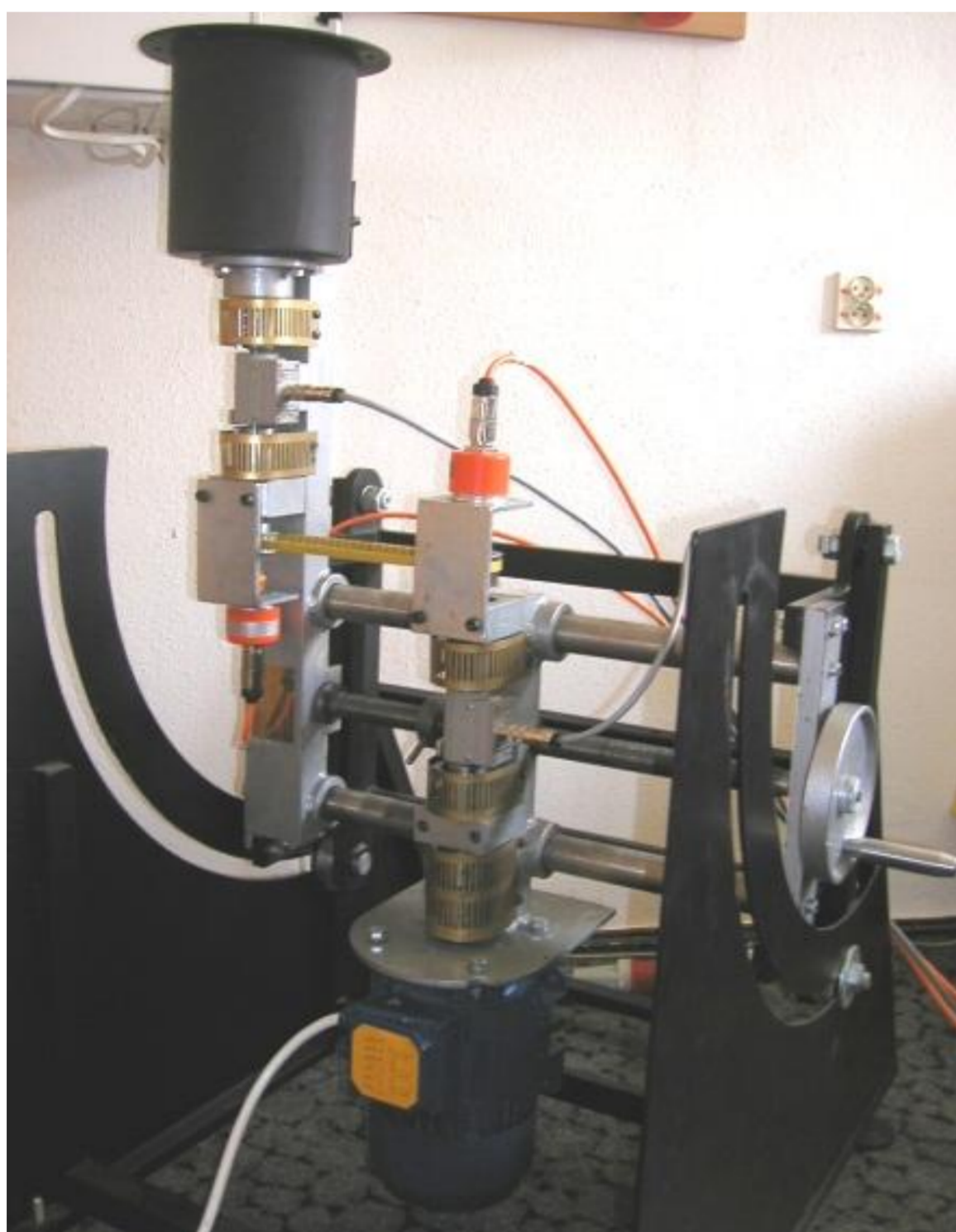
universal laboratory crusher unit ULR-2.0 / 2004 with an attached shredder probe, with vertical position of the drive shaft

The subject of the invention is a device for the grinding of biological materials and plastics. The variety of materials to be shredded is very large, both in terms of shape and mechanical properties. The disadvantage of the known design solutions of plastic shredders is their low efficiency, high energy demand, and high noise level. Moreover, the design features entail a high risk of damaging the working elements - especially the knives. The proposed solution solves these problems.